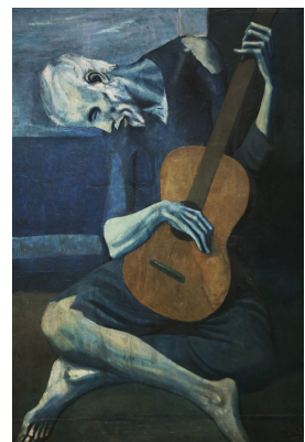
The Old Guitarist by Pablo Picasso, 1904