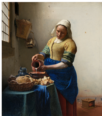
The Milkmaid by Johannes Vermeer, 1668