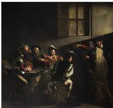
The Calling of Saint Matthew by Carravagio, 1600