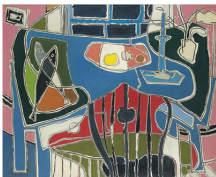
The Blue Table with Window by Patrick Heron, 1954