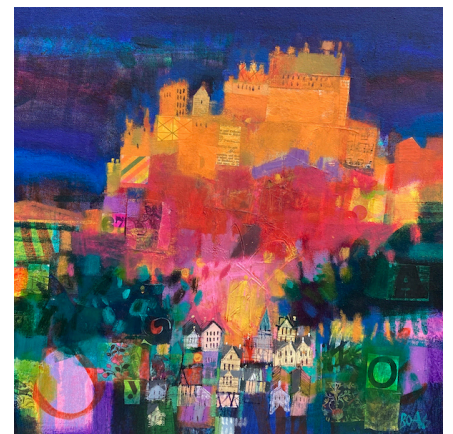
Edinburgh Castle Morning by Francis Boag, 2023