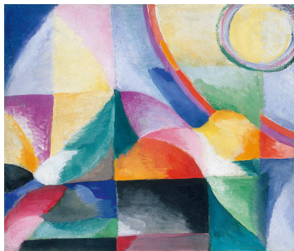
Simultaneous Contrasts by Sonia Delauney, 1912