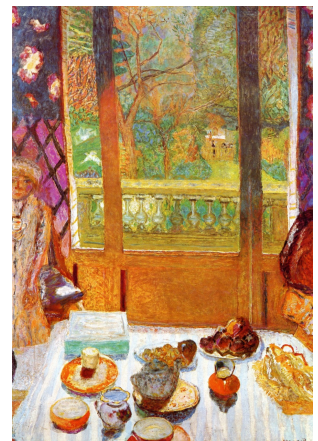
The Breakfast Room by Pierre Bonnard, 1930